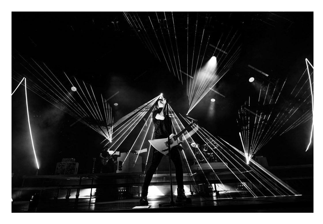
March 10 New Orleans, LA The Fillmore New Orleans March 11 Kinder, LA Mikko Live! March 13 Huntsville, AL Von Braun Center March 14 Knoxville, TN Knoxville Civic Auditorium March 15 Macon, GA Macon City Auditorium